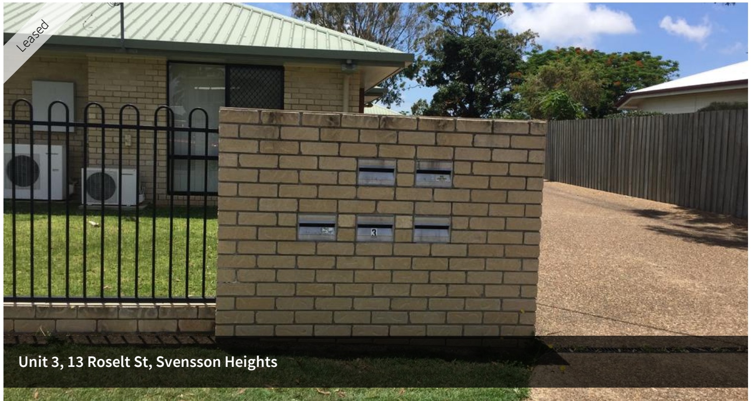
Unit 3, 13 Roselt St, Svensson Heights